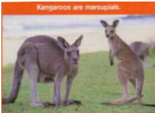
Kangaroos are marsupials.

Many Australian animals are unique: koalas, kangaroos, wombats, platypus, dingoes and more!