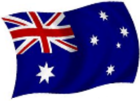
The Australian's Flag