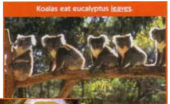
Koalas eat eucalyptus leaves.