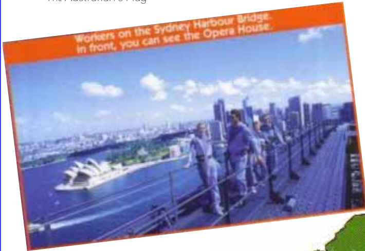
Workers on the Sydney Harbour Bridge. In front, you can see the Opera House.